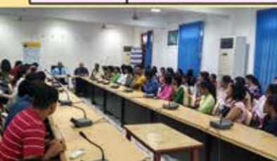
Induction meeting for Fresh Learners