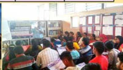
Meeting with CSC owners of Andaman