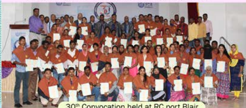
30 th Convocation held at RC port Blair